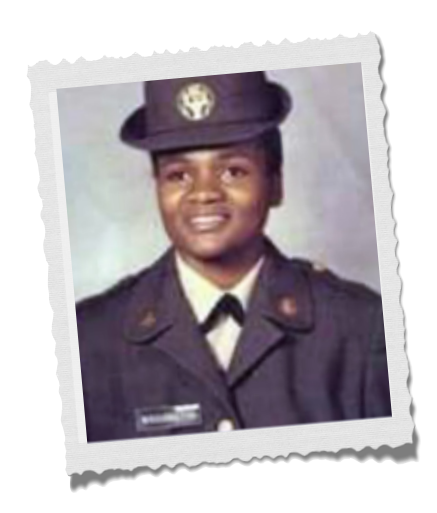
Don't let your hearts be troubled. Trust in God, and trust also in me. JOHN 14:1-3

A wife, a mother, a grandma too This is the legacy we have from you. You taught us love and how to fight You gave us strength you gave us might. A stronger person would be hard to find, And in your heart, you were always kind. You fought for us all in one way or another Not just as a wife, not just as a mother For all of us you gave your best Now the time has come for you to rest So go in peace, you've earned your sleep, Your love in our hearts, we'll eternally keep. (AUTHOR UNKNOWN)