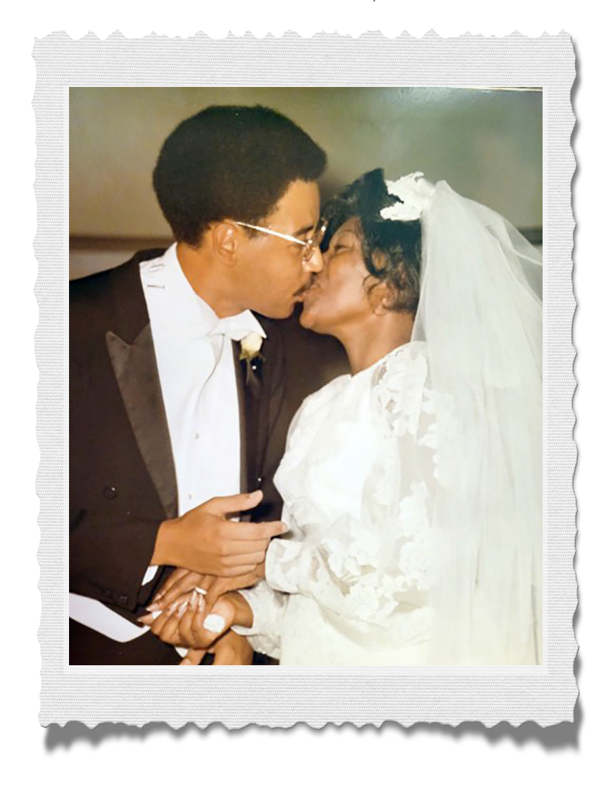
51 Years "Til death do us part."